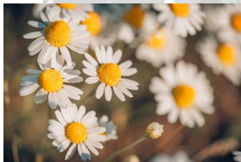
Spring is in the Air.