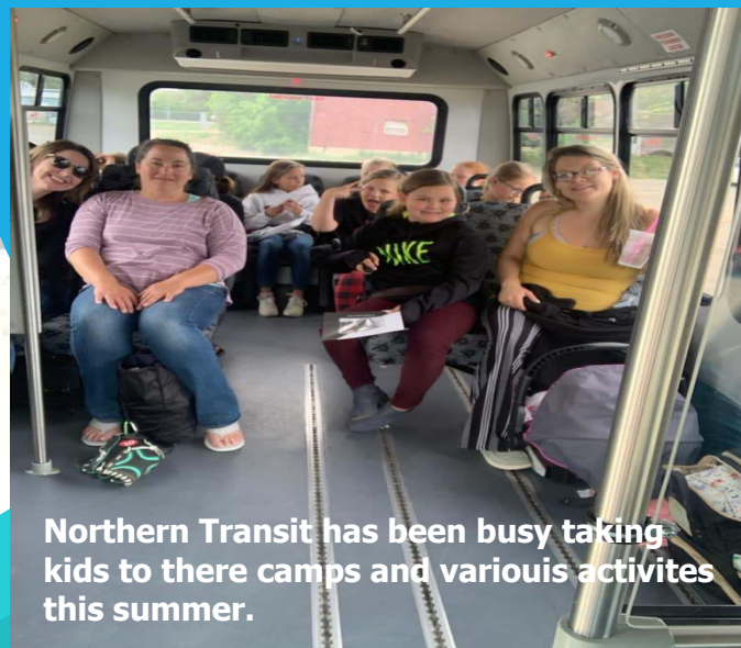
Northern Transit has been busy taking kids to there camps and various activites this summer.

As always you can call and make those reservations 406-470-0727 or email ntienjoytheride@gmail.com